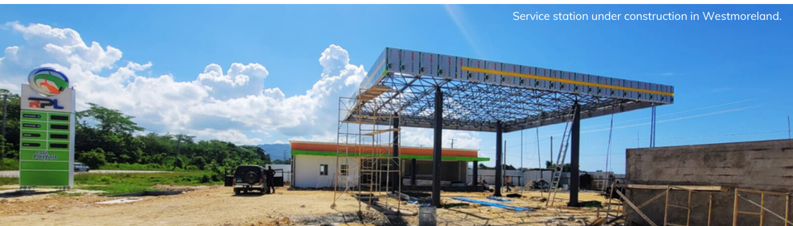
Service station under construction in Westmoreland.